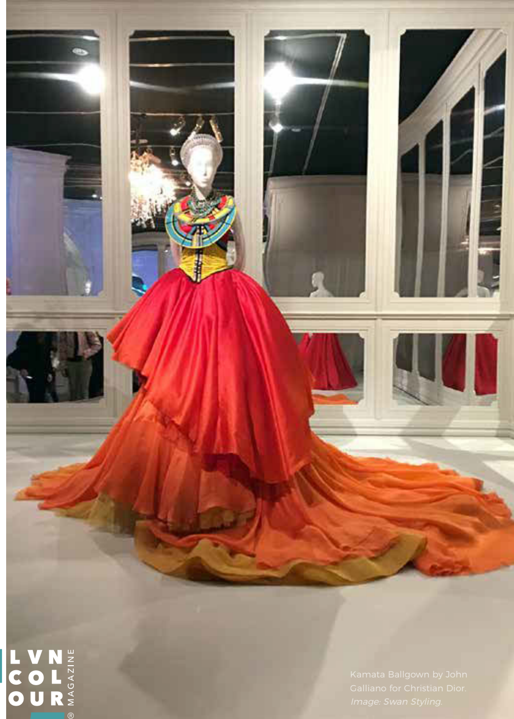
Kamata Ballgown by John Galliano for Christian Dior.

Melbourne Fashion Week GenNEXT Anti-Poverty Week Mental Health Awareness Month LVN Colour Creatives Holiday Gift Guide Lagos Fashion Week