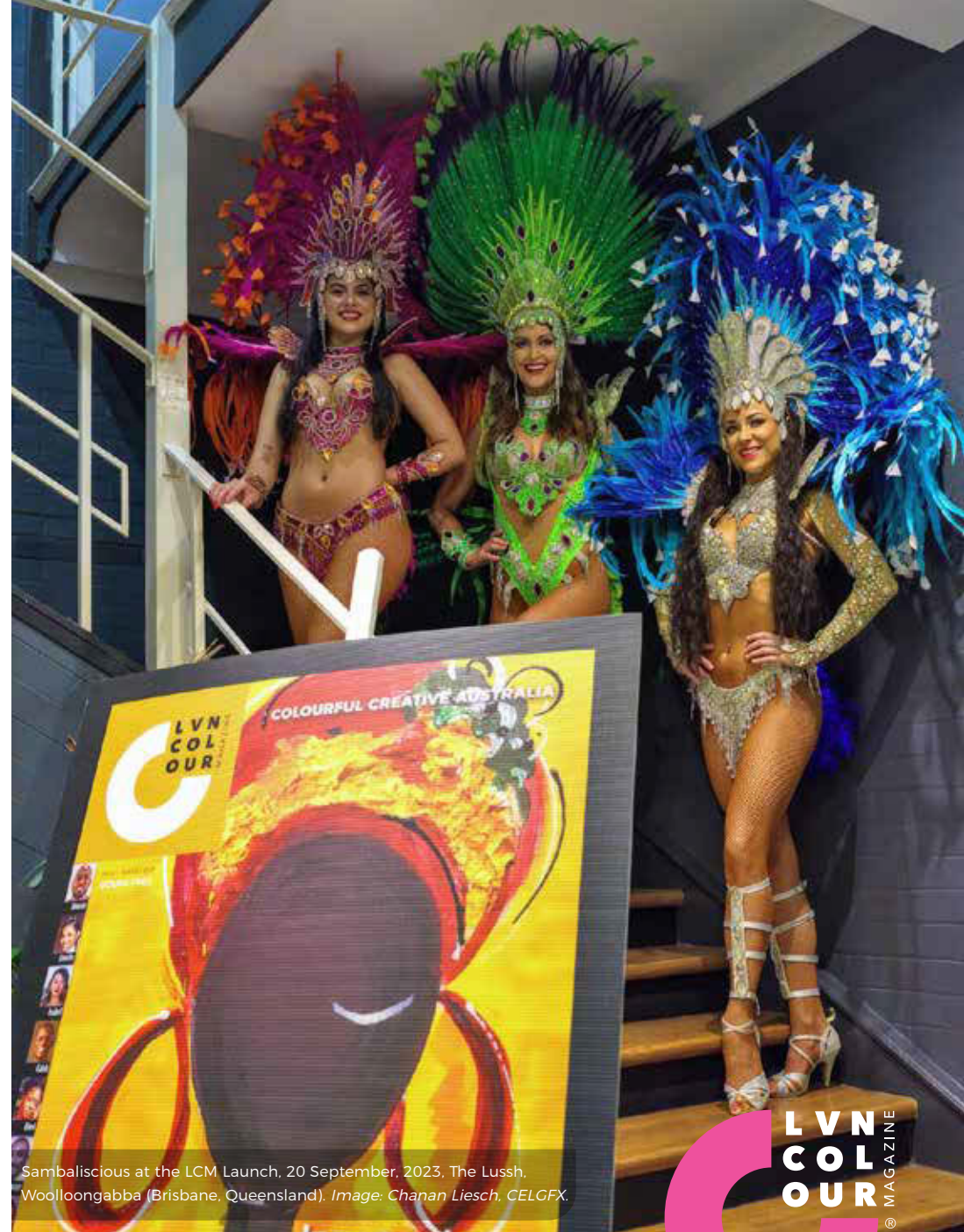
Sambalicious at the LCM Launch, 20 September, 2023, The Lushh, Woolloongabba (Brisbane, Queensland).

Email editor@livingcolourmagazine.com.au to explore tailored print, digital, and LVN guide bundle options.